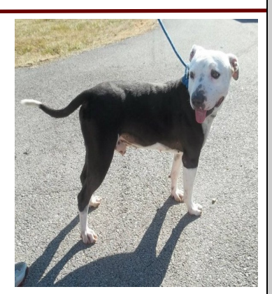
Petey, a Pit Bull, and

Rescuers working together to obtain a common goal...that's what it's all about!!